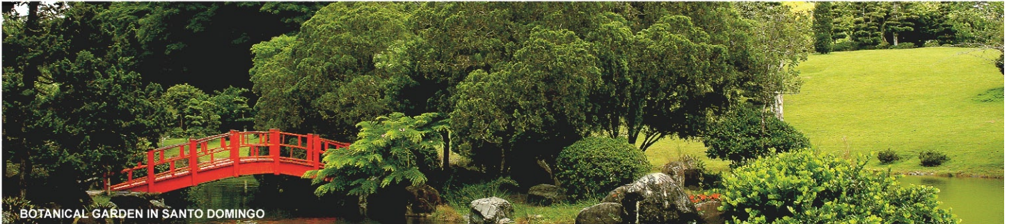
BOTANICAL GARDEN IN SANTO DOMINGO