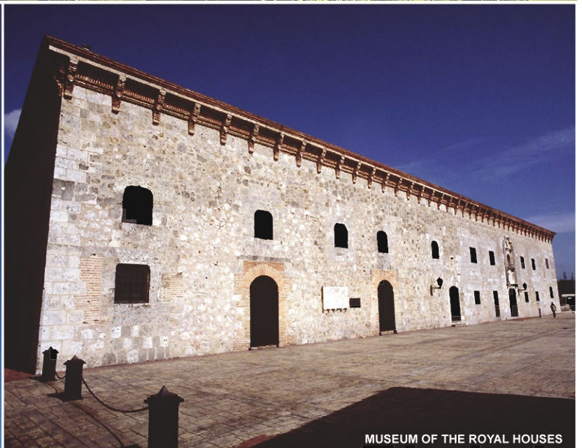
MUSEUM OF THE ROYAL HOUSES